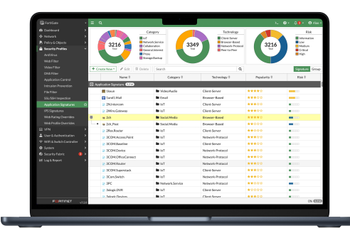
Visibility with FOS Application Signatures