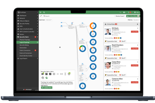
Intuitive easy to use view into the network and endpoint vulnerabilities